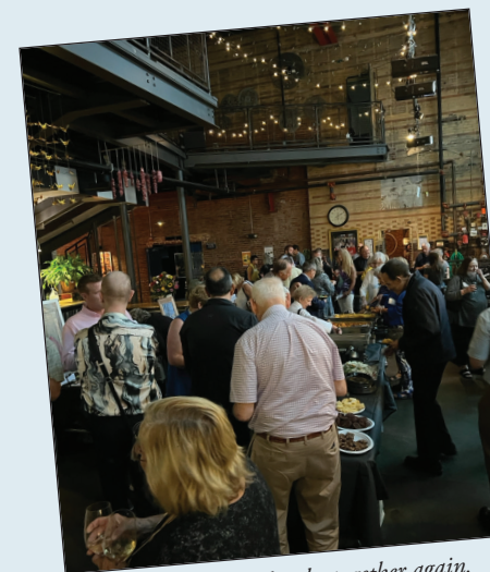
It was wonderful to be together again.